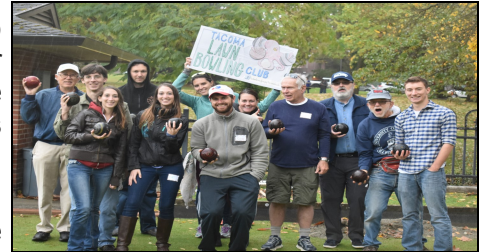
Enjoying their "new" bowls.