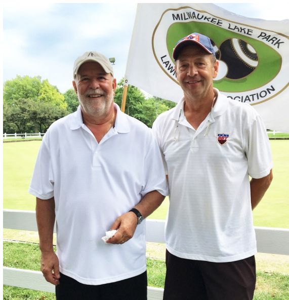
More from Central on Page 3