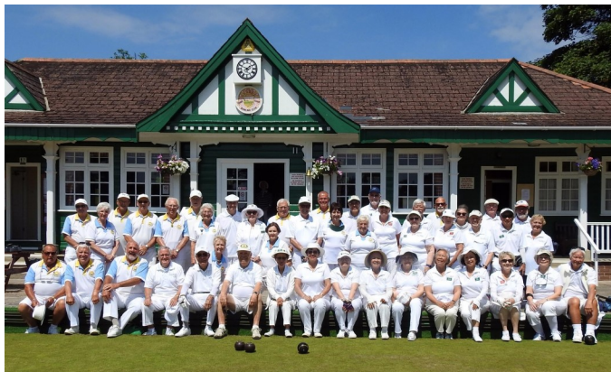
Torbay and Rossmoor bowlers before their games began.