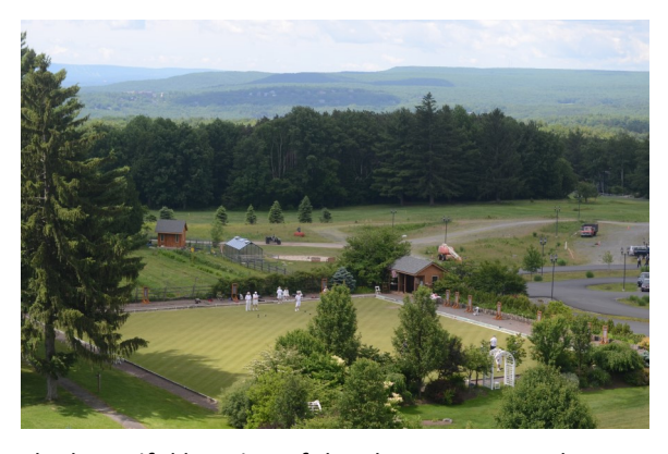
The beautiful location of the Skytop LBC was the setting for the 2014 NED Pairs play downs.