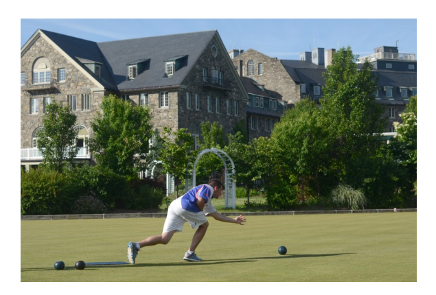
Skytop, site of North East Division Playdowns

The following photos and articles are from Rich Sayer and the newly upgraded website for the North East Division