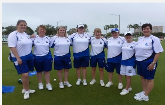
Scottish Women's Team