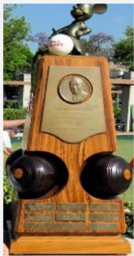
Walt Disney Championship Trophy

The Walt Disney Championship Trophy resides at the Beverly Hills Lawn Bowling Club in Beverly Hills, CA, where Disney was a longtime member. Created by the Walt Disney Company, the nearly four-foot trophy features Mickey Mouse at the very top, a replica of Walt's Presidential Medal of Freedom, a set of his personal bowls, and the names of every winner of the annual Disney tournament since 1970. This year's 44th Disney rolls on the 3-day Memorial Day weekend, May 24-26, 2014.