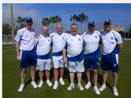
Scottish Men's Team