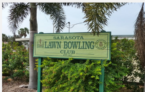
Sarasota Lawn Bowling Club, Sarasota, Florida

The Sarasota club invited the neighboring clubs of Sun City, Maple Leaf, Lakeland, Clearwater, Sun 'N Fun and Top of the World to watch and hosted a BBQ and band one evening.