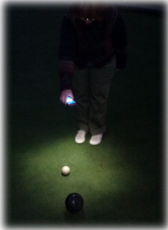
Bowling in the dark by the light of a cell phone!